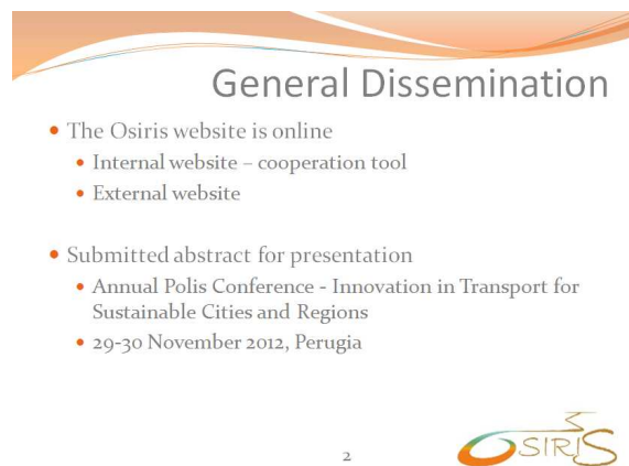
Figure 2 : OSIRIS PPT template

To be used for PowerPoint Presentations.